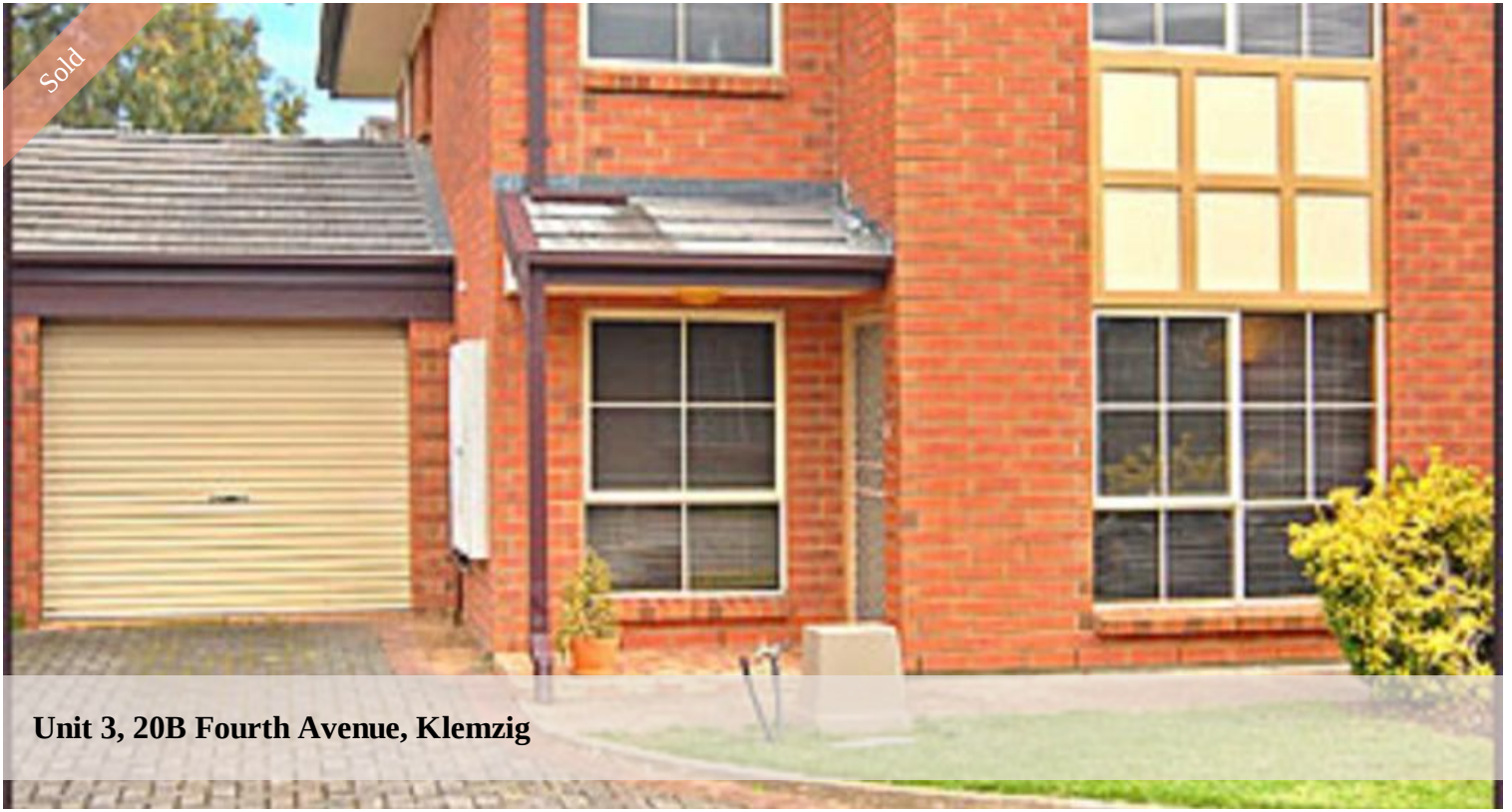
Unit 3, 20B Fourth Avenue, Klemzig